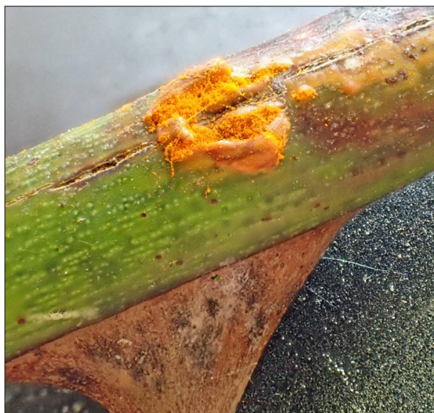
Right: Phragmidium mucronatum (NF)

Another of the same rust genus was noticed on Rosa sp (possibly Dog Rose) and appears not to have been recorded here previously.