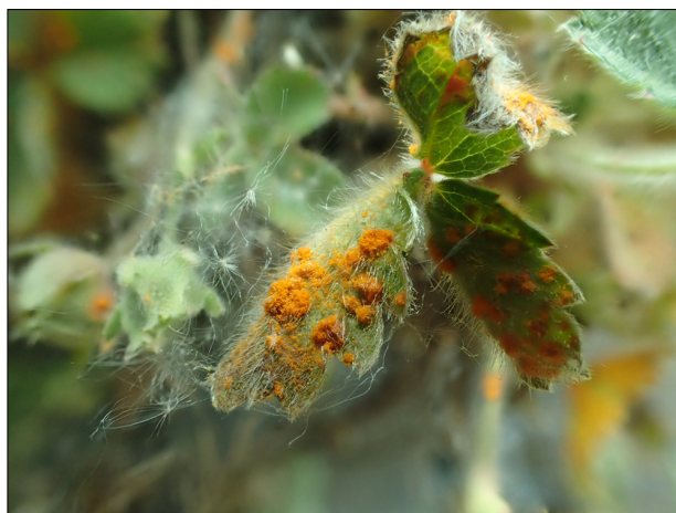
Right: Phragmidium fragariae (SJE)

Another of the same rust genus was noticed on Rosa sp (possibly Dog Rose) and appears not to have been recorded here previously.