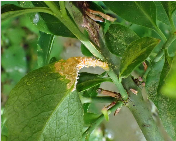
Left: Melampsora euonymi-caprearum (NF)

name. The shrub turned out to be Euonymus europeae (Spindle) which then led both Neil and Sarah to work out its identity independently, though this is another example of a species being recently split according to its host. Previously known as Melampsora epitea , the species found on Spindle at one stage of its development (and Salix - Willow at another stage) is now Melampsora euonymi-caprearum , though it has been recorded from Rushbeds before under the previous name.