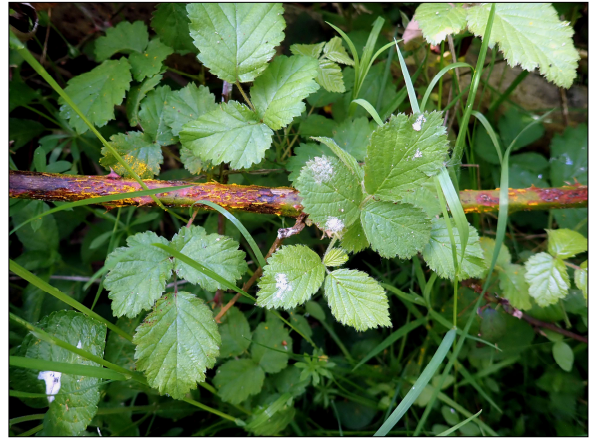
Right: Kuehneola uredinis

Still on the tramway we spotted yet another such rust but this time it took us a little while to identify the all important host plant – if you know the name of the plant it makes its