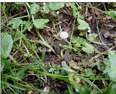
Left: Psathyrella corrugis – can you spot the even tinier cap in the photo?! (PC)

Both Gill and Bill separately found two of today's mushrooms, though I suspected these were both the same species of Psathyrella (Brittlestem) – wrongly as it turned out. Both were good spots and were very small and 'mycenoid' – no more than 1cm across at most, but the darkening greyish gills gave away their genus. The first, in the tramway, was as I suspected P. corrugis (Rededge Brittlestem) – a common species though the gills lacked a red edge which seems to be a variable feature. (I was at this stage so pleased that any mushroom had been found that I pounced on it for a photo to include in this report!)