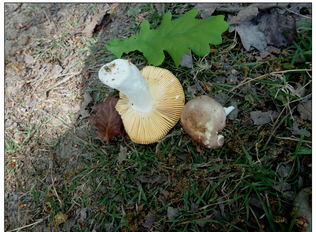
Above: Russula inopinata nom. prov. – new to science! (PC)

Update: In April 2026 came the exciting news that this collection was to be declared a species new to science with the discovery of an earlier Kent collection which matched its unique DNA sequence. It is to be named Russula inopinata nom. prov., the epithet meaning unexpected / a surprise. We now need to make one further collection to enable the name to be officially validated rather than 'nom. prov.' indicating provisional.