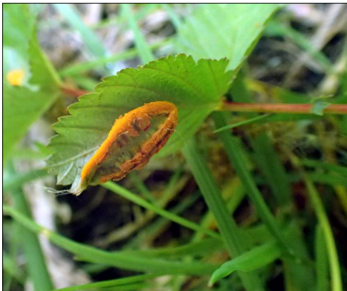
Left: Triphragmium filipendulae and

Turning onto the main central ride we found two different pathogens growing separately on Filipendula ulmaria (Meadowsweet), one a rust and the other a powdery mildew. Triphragmium filipendulae (Meadowsweet Rust) has been recorded here before, but Podosphaeria filipendulae appears to be new. The first example we found was completely coating the plant in 'white dust' – so much so that we struggled to identify the plant until a further example less affected was found.